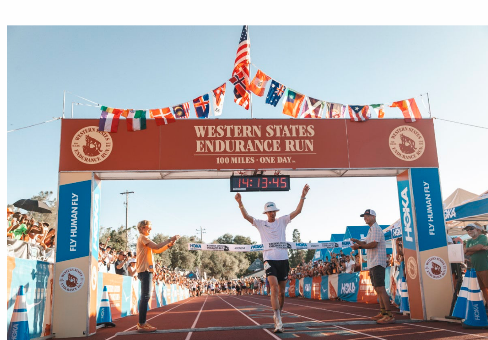
high-res photo